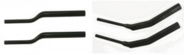
Mark I extensions - LEFT Mark II extensions RIGHT